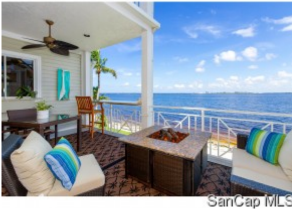
Living Area Porch