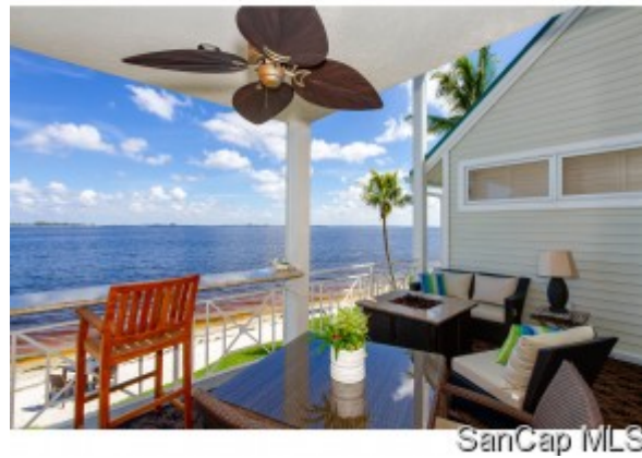
Living Area Porch